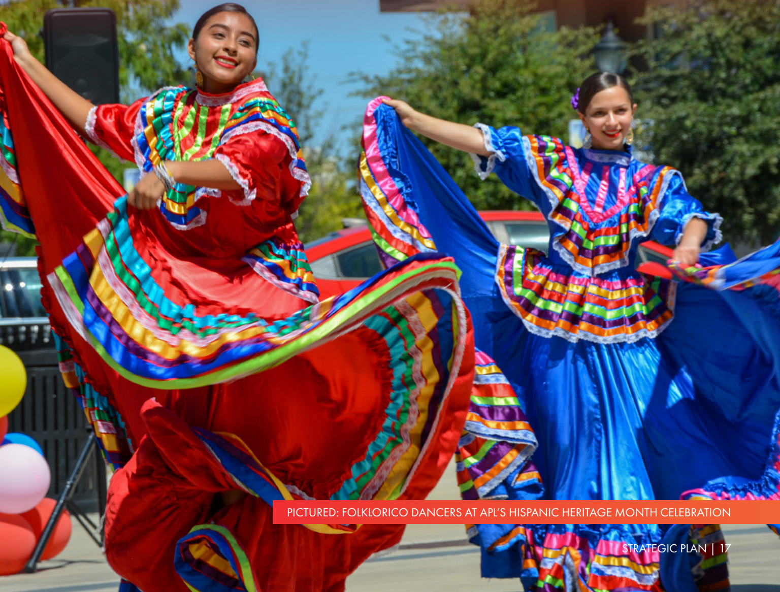
PICTURED: FOLKLORICO DANCERS AT APL'S HISPANIC HERITAGE MONTH CELEBRATION