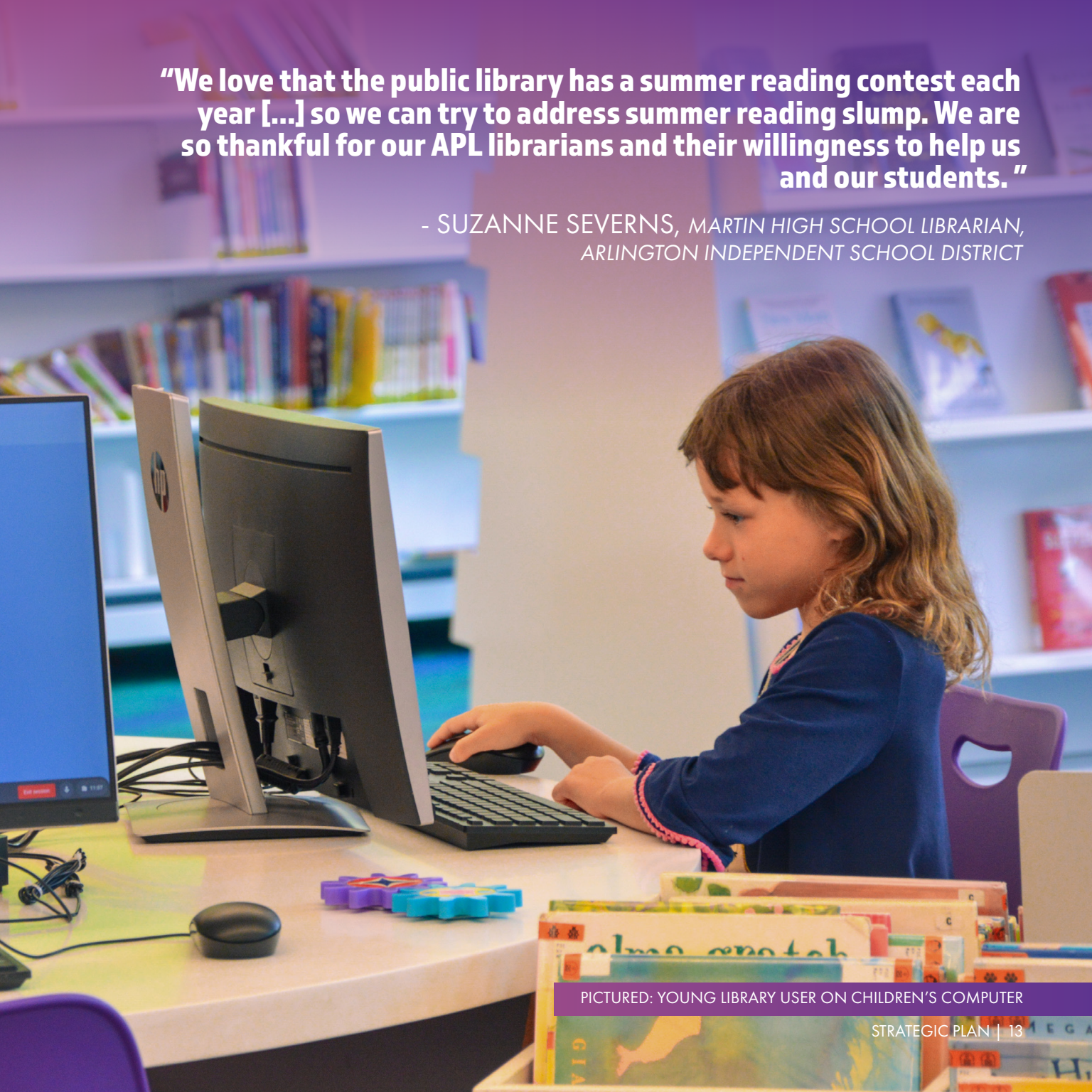
PICTURED: YOUNG LIBRARY USER ON CHILDREN'S COMPUTER